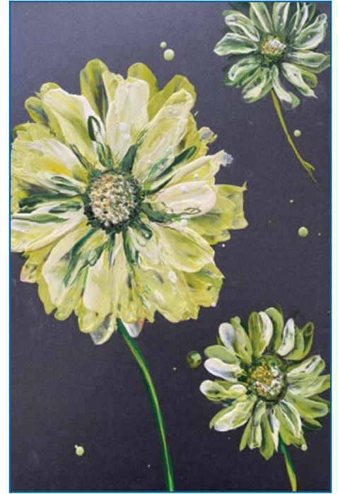
SECOND PLACE: "Trio in Green" Maureen Zmak