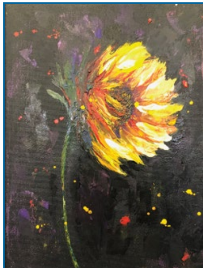
SECOND PLACE: "Flower" Maureen Zmak