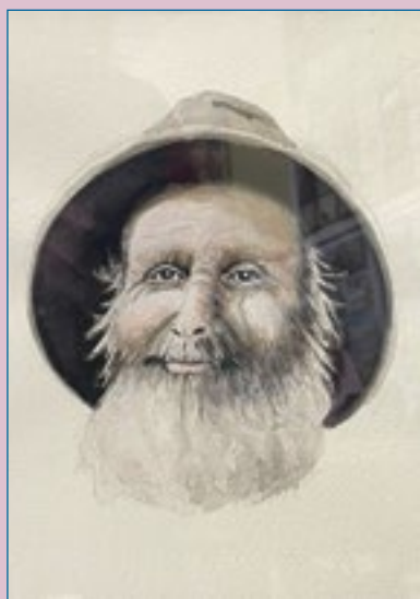
SECOND PLACE: "Portrait Of Old man" Susan Pallizzaro