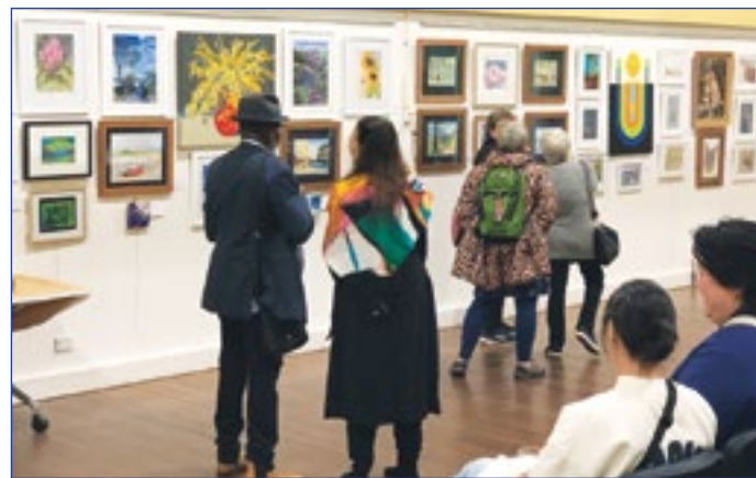
The many artwork entries filled the walls of the hall.

The show was really well received by all who visited. I walked around speaking to many of our visitors and everyone I spoke to were very enthusiastic in their praise of the quality and depth of the work displayed. This was shown in the amount of work sold. We sold 19 paintings , so with our 15% commission that generated $409.50 to the group and with donations of $50 and $270 from the sales of Devonshire Teas we have added a total of $729.50 to our healthy bank account.