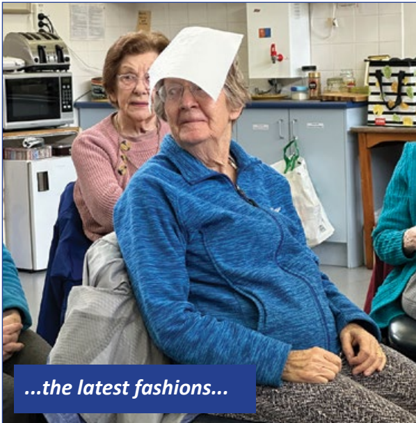
...the latest fashions...