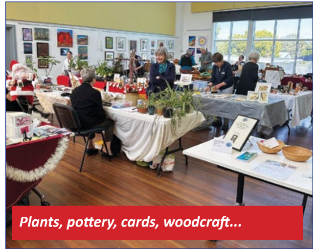
Plants, pottery, cards, woodcraft...