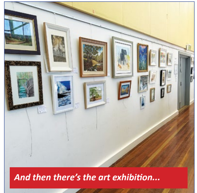
And then there's the art exhibition...