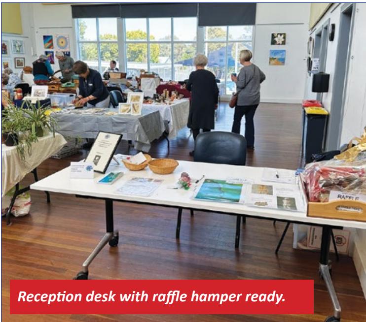
Reception desk with raffle hamper ready.