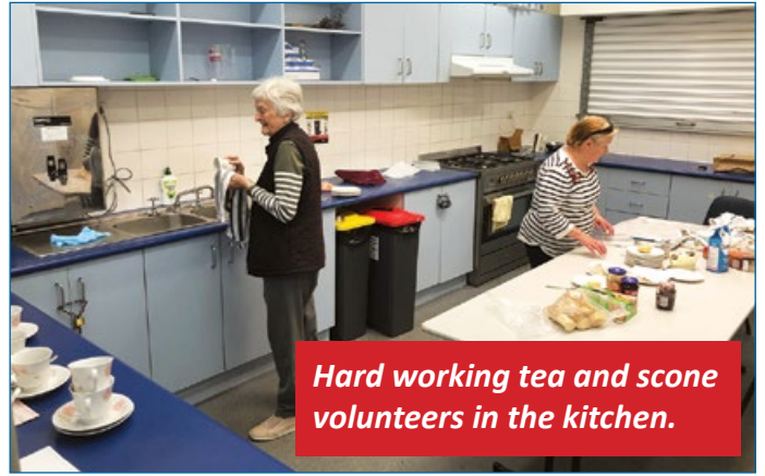
Hard working tea and scone volunteers in the kitchen.