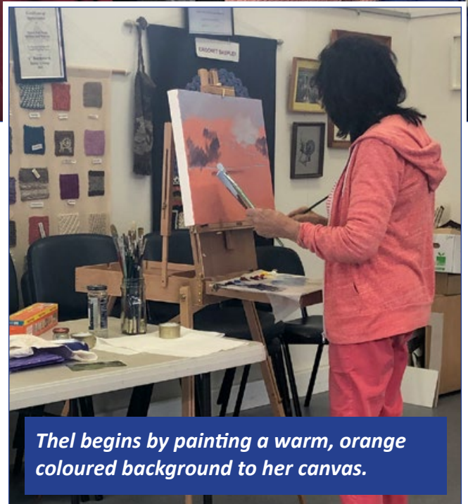
The Caldwell begins by painting a warm, orange coloured background to her canvas.