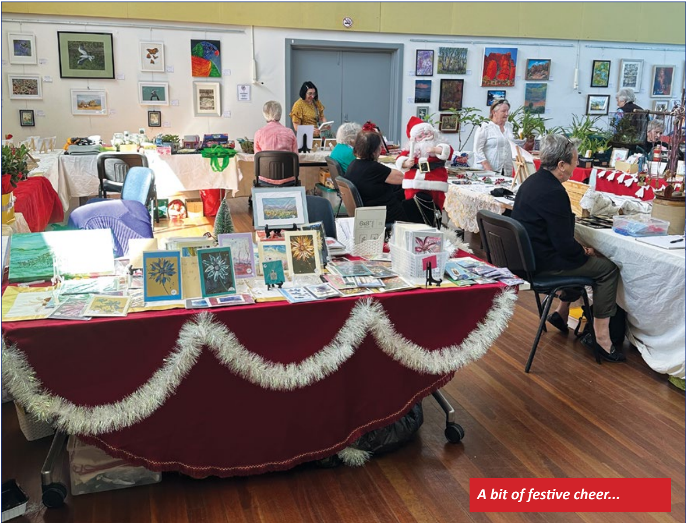
A bit of festive cheer...